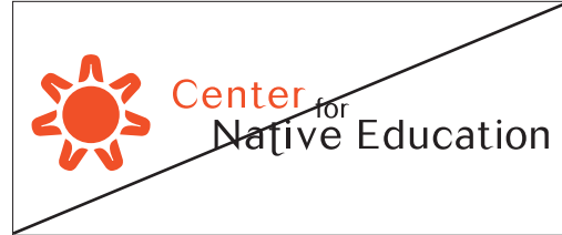
Do not alter the colors