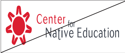
Do not distort, stretch or change the shape of the logo

Proper use of the logo is essential in maintaining brand integrity. Please do not alter the logo in any way. Always use master logo artwork for reproduction. The following examples below illustrate incorrect usage.