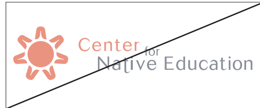
Do not tint the logo