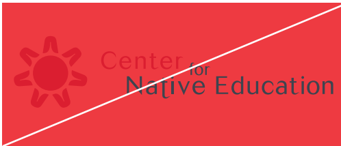
Do not place the logo on a illegible background