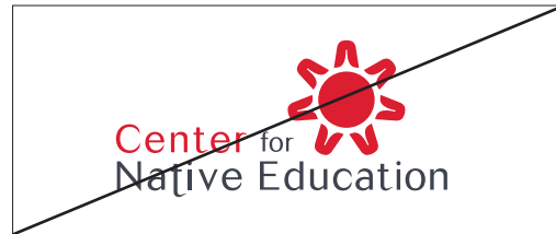
Do not reconstruct or reconfigure the logo